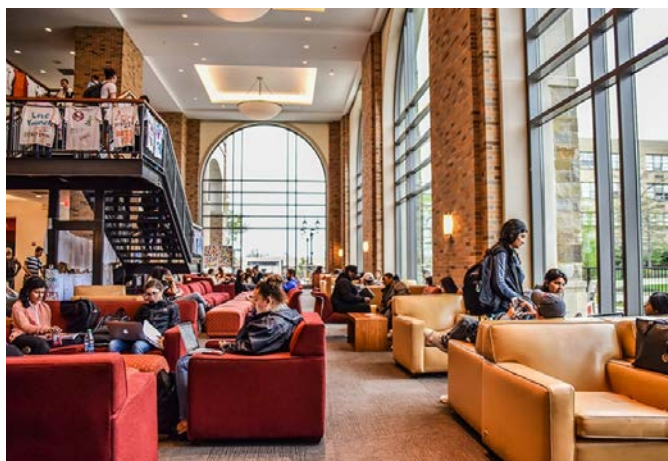
Student common room